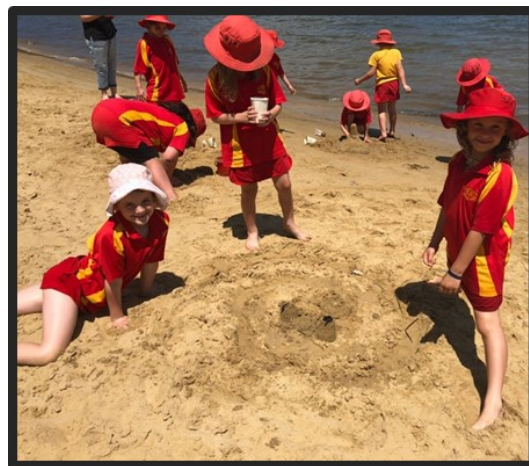
Fun at the beach on Dangar Island