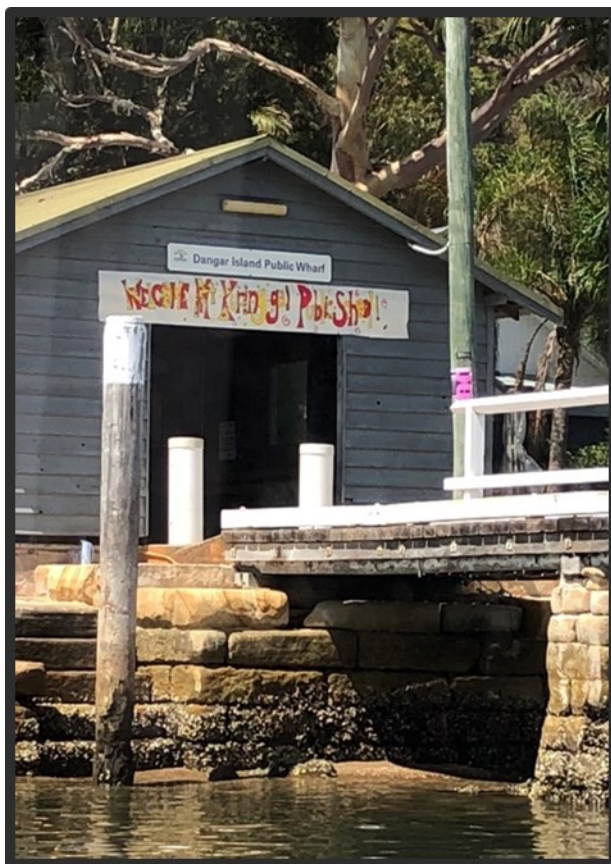
Our welcome sign on arrival